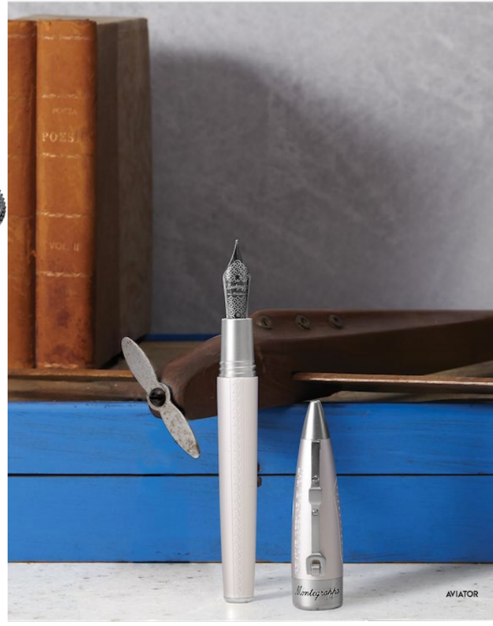
AVAILABLE AT MONTEGRAPPA BOUTIQUES AND AUTHORISED DEALERS WORLDWIDE