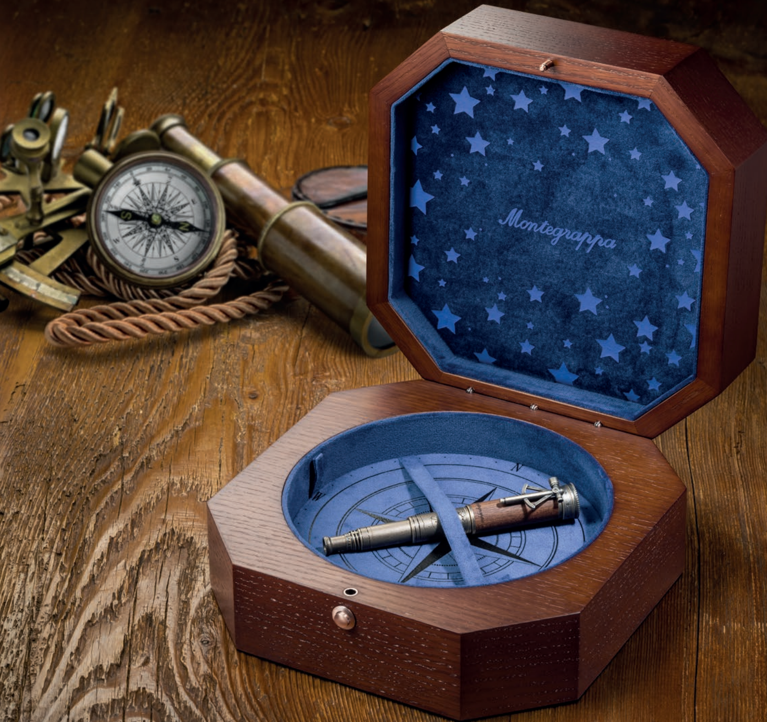
Custom “compass chest” presentation case